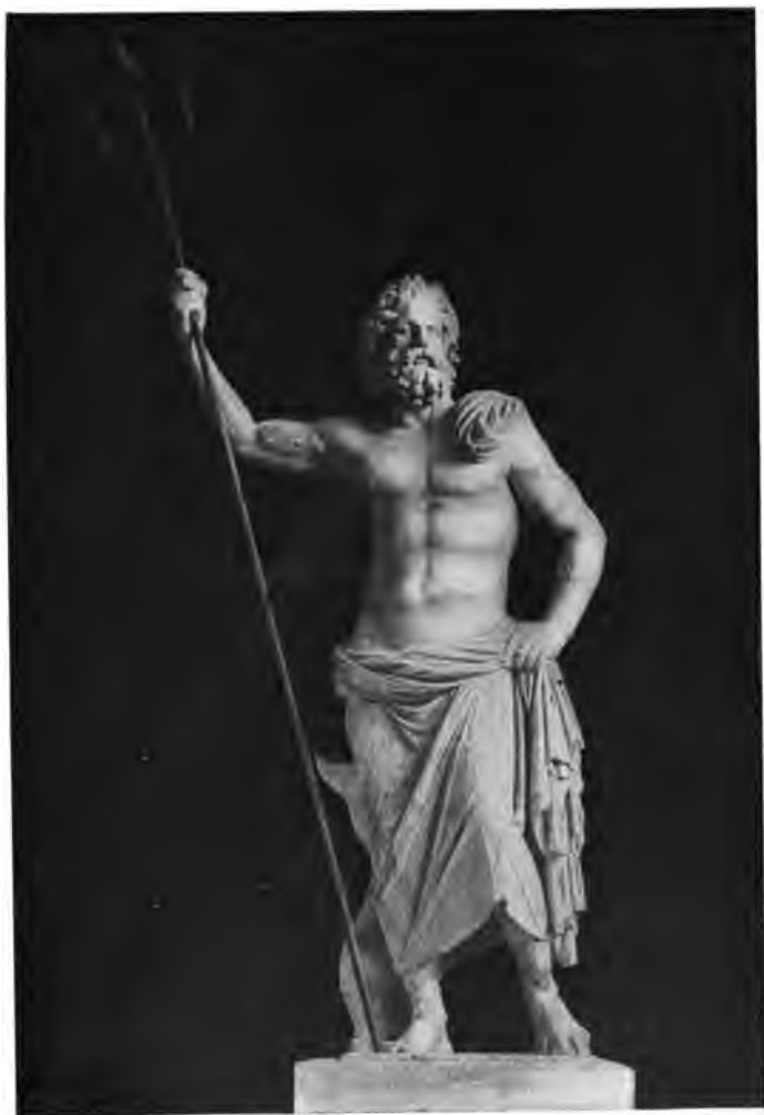
Fig. 39. Poseidon.